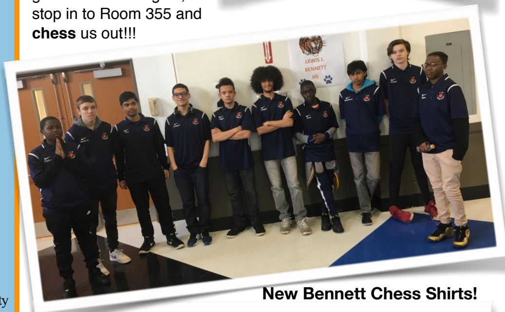
New Bennett Chess Shirts!