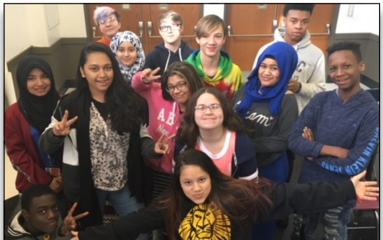
Recognizing Academic Achievement

A diverse group of students were recognized at the first marking period Achievement Ceremony. Students on the Merit Roll, Honor Roll and High Honor Roll were commended!