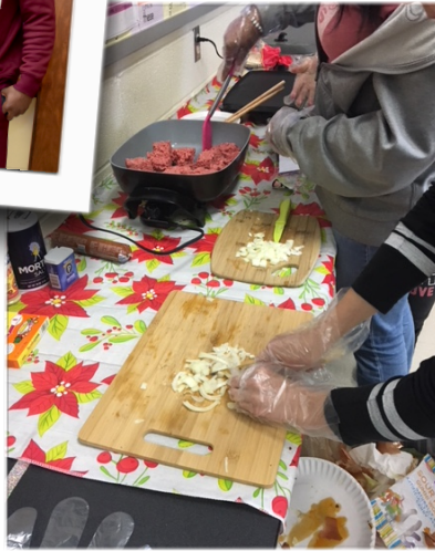
Spanish Class Cooking - Alumni Mini Grant