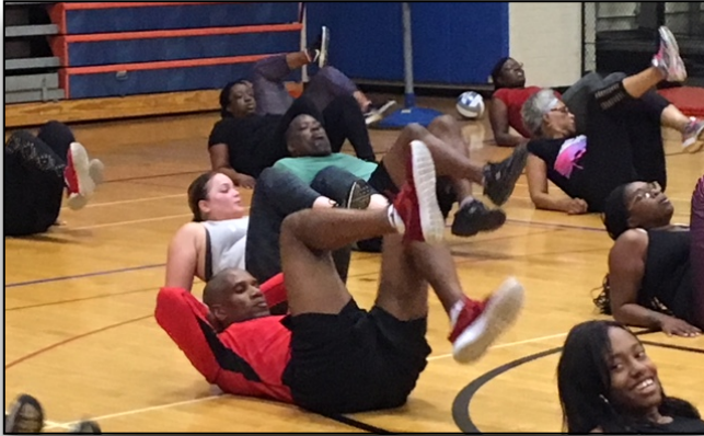
Promoting Healthy Living!

Saturday Academies started out with our welcome back to school theme where we challenged everyone to complete the obstacle course created by our partners at Canisius College.