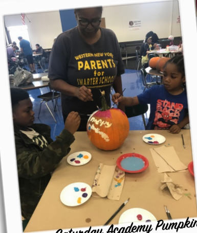
Saturday Academy Pumpkins