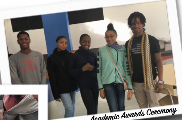
Academic Awards Ceremony