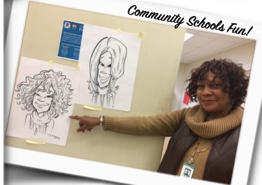
Community Schools Fun!

WORK HARD, HAVE FUN, CELEBRATE SUCCESSES... GO TIGERS!!