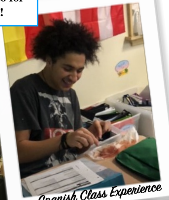
Spanish Class Experience