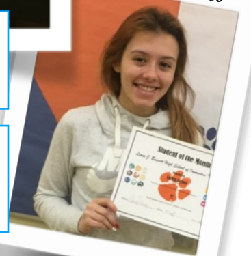
Student of the Month

WORK HARD, HAVE FUN, CELEBRATE SUCCESSES... GO TIGERS!!