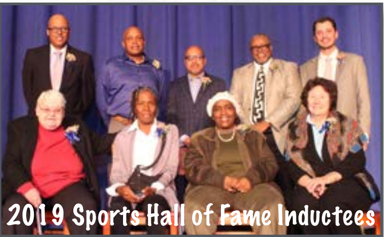
2019 Sports Hall of Fame Inductees