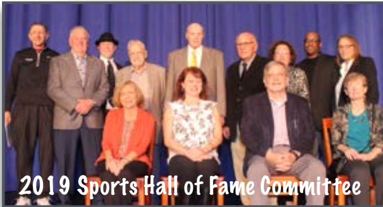
2019 Sports Hall of Fame Committee

Your additions or corrections are requested. Please forward to the Bennett Beacon staff.